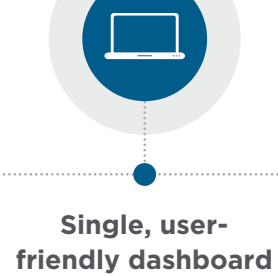
to manage all endpoints and activity